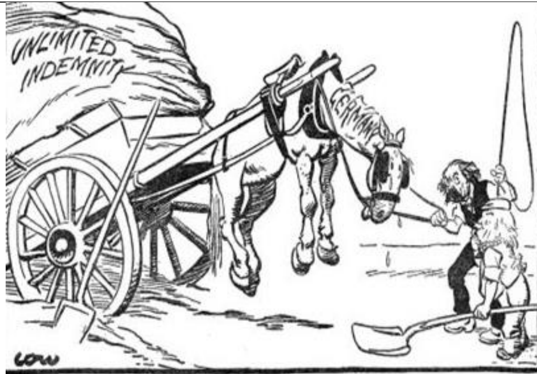
"PERHAPS IT WOULD GEE-UP BETTER IF WE LET IT TOUCH EARTH"

Analyze the political cartoons using SCAMS.