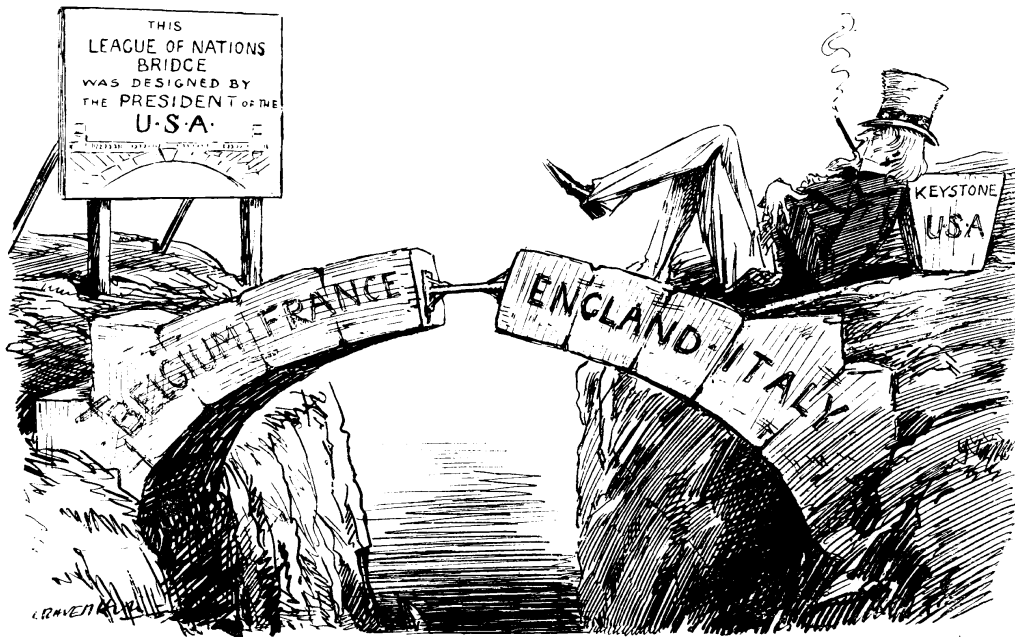
THE GAP IN THE BRIDGE.

S (Subject) – C (Caption/Text) – A (Action) – M (Message) – S (Symbols) – 1. Man hiding – 2. Cannon – 3. Conductor –