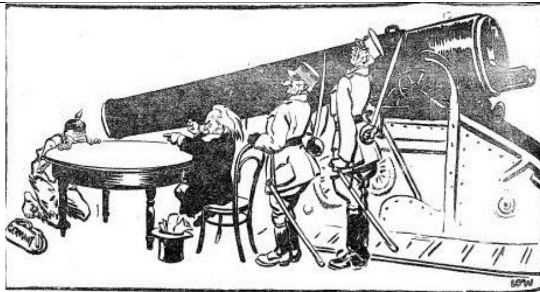
DAVID THE SPOKESMAN: "Off with the spiked hat! What d'you think we fought for if not to abolish militarism?"

S (Subject) – C (Caption/Text) – A (Action) – M (Message) – S (Symbols) – 1. Man hiding – 2. Cannon – 3. Conductor –